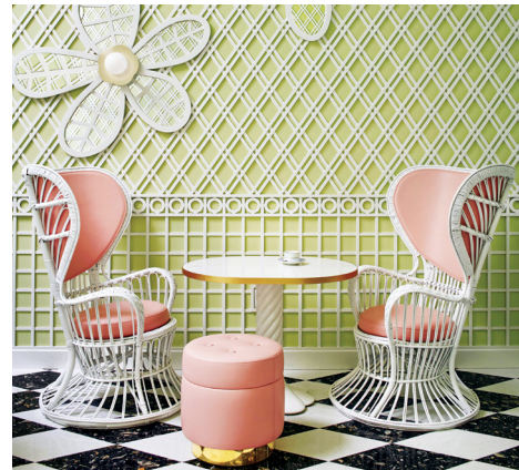
Ladurée Beverly Hills

In recent years, Beverly Hills has evolved into an epicenter for gourmet and culinary specialties. Chocolate lovers have an array of delectable options, including gourmet chocolatiers featuring champagne truffles at Teuscher Beverly Hills, classic French macarons at Ladurée Beverly Hills, handmade confections at Edelweiss Chocolates and Diane Kron's signature chocolate-covered strawberries at Kron Chocolatier. A decadent Sprinkles cupcake will make you think you're in heaven, whether you purchase it in-store or at the original 24-Hour Sprinkles ATM. The Cheese Store of Beverly Hills offers some of the rarest gourmet cheeses from around the world.