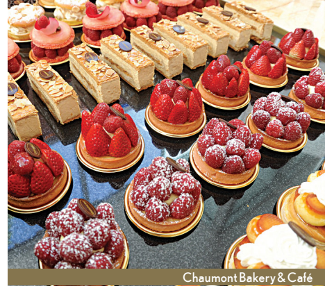
Chaumont Bakery & Café