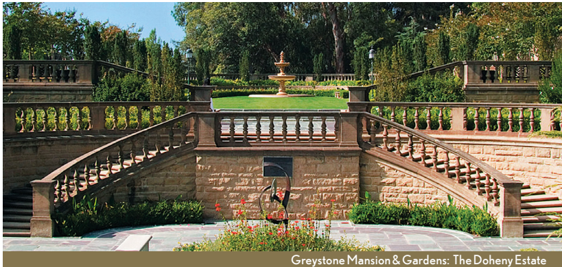
Greystone Mansion & Gardens: The Doheny Estate